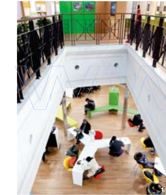
1 Desks are available all around the library for studying and reading. 2 The library is spacious and full of light for the convenience of visitors. 3 The five-meter high bookcase is a popular feature of the library.

If you are walking around downtown Seoul, you will almost certainly pass through Seoul Plaza. Located in the heart of the city, the Seoul Plaza is at the crossroads to all areas of old Seoul – Sejong-daero road will lead to Gyeongbokgung Palace, to the north is Cheonggyecheon Stream, and Myeong-dong and Namdaemun are a short walk away. The Plaza has witnessed many history-changing events in Korea for more than a hundred years.