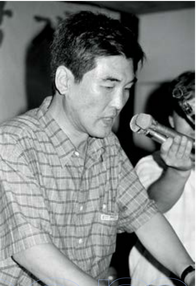
Kim argues that society must create a new type of culture based on respect for life and principles of life.

Kim received the Lotus Prize for Literature in 1975 from the Afro-Asian Writers’ Association, when he was still in prison. In 1981, he received the Bruno Kreisky Award for Services to Human Rights from the Bruno Kreisky Foundation for Human Rights and the Great Poet Award from Poetry International. His publications include the poetry anthology Kkotgwa Geuneul (lit. Flowers and Shades ) as well as essay anthologies Saengmyeong (lit. Life ), Yullyeoran Mueosinga (lit. About Yullyeo ), Yegame Chan Sup Geuneul (lit. Shades of the Woods Full of Presentiment ), and Yet Gayaeseo Ttuiuneun Gyeoul Pyeonji (lit. A Winter Letter from Old State of Gaya ).