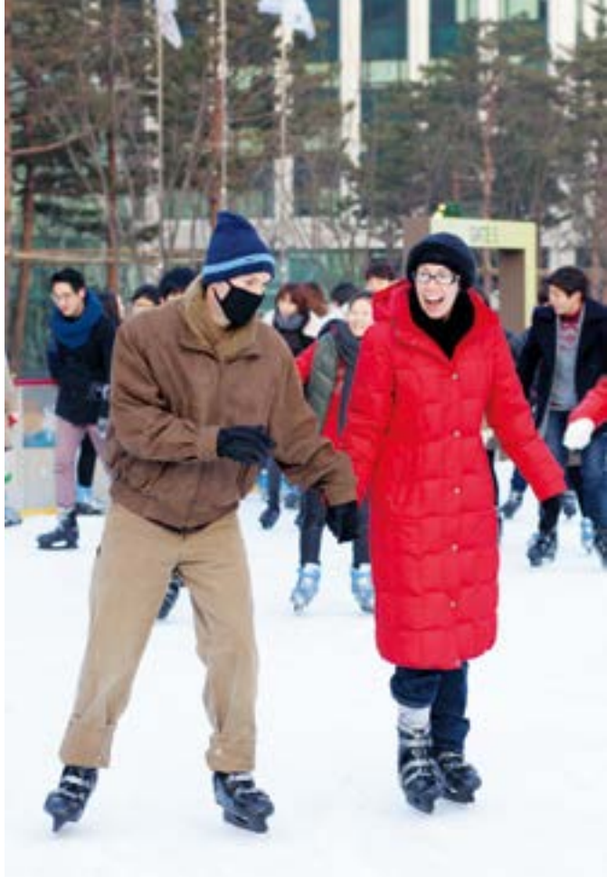
Ice skating in the middle of downtown Seoul is sure to be an unforgettable memory for many foreign visitors.

The library has a collection of over 200,000 volumes and 20 computers to view 4,200 DVDs and audio books. Visitors are free to walk into the library to read books, catch up with current affairs, or just take a break from walking. The third floor displays the most iconic features of the library where visitors can see the restored and remodeled old Mayor's Office, reception room, and meeting room.