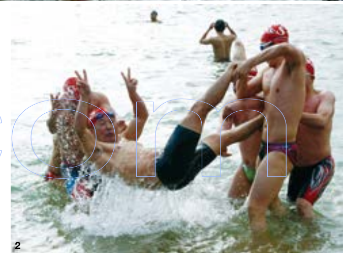
1 The Seogwipo Penguin Swimming Festival is held to put the last year behind and plan for a brighter new year. 2 Around 2,000 to 3,000 people visit the festival every year.

Still, Jungmun, where the Penguin Swimming Festival takes place, is definitely one of Jeju’s best tourist destinations, famous for the Yeomiji Botanical Garden, the tiered Cheonjeyeon Waterfalls, and the Jungmun-Daepo Columnar Joints. The area has excellent accommodations and leisure facilities including hotels, condominiums, golf courses, windsurfing areas, and shopping centers. This is, needless to say, an extremely popular area for tourists.